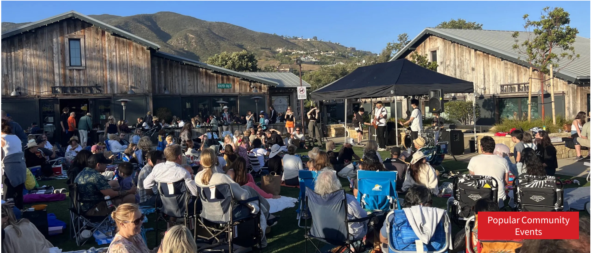
Popular Community Events