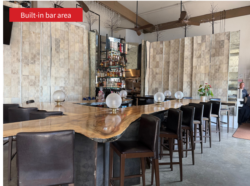
Built-in bar area