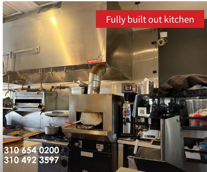
Fully built out kitchen