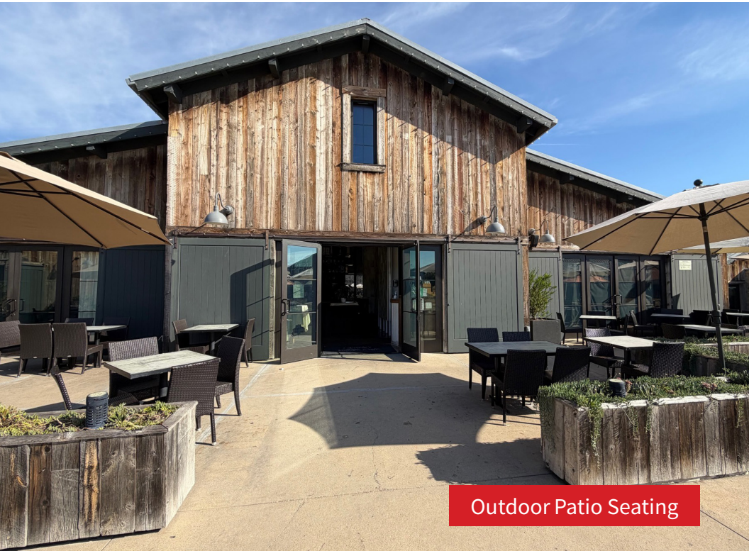
Outdoor Patio Seating