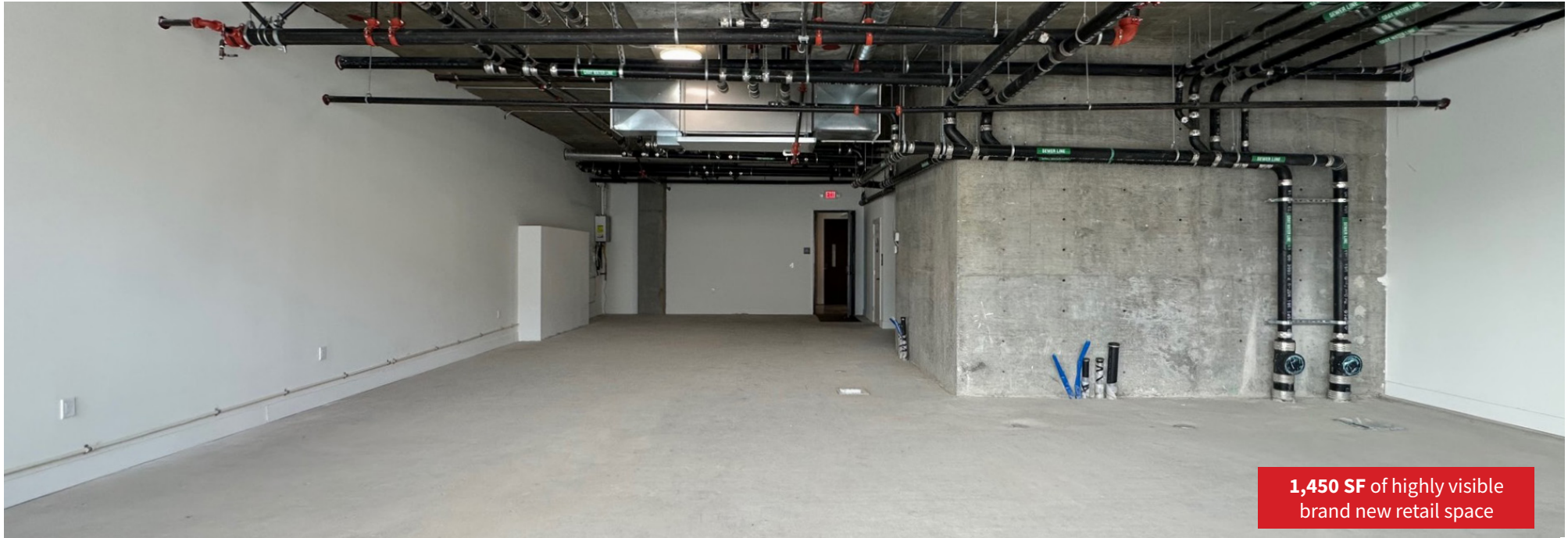
1,450 SF of highly visible brand new retail space