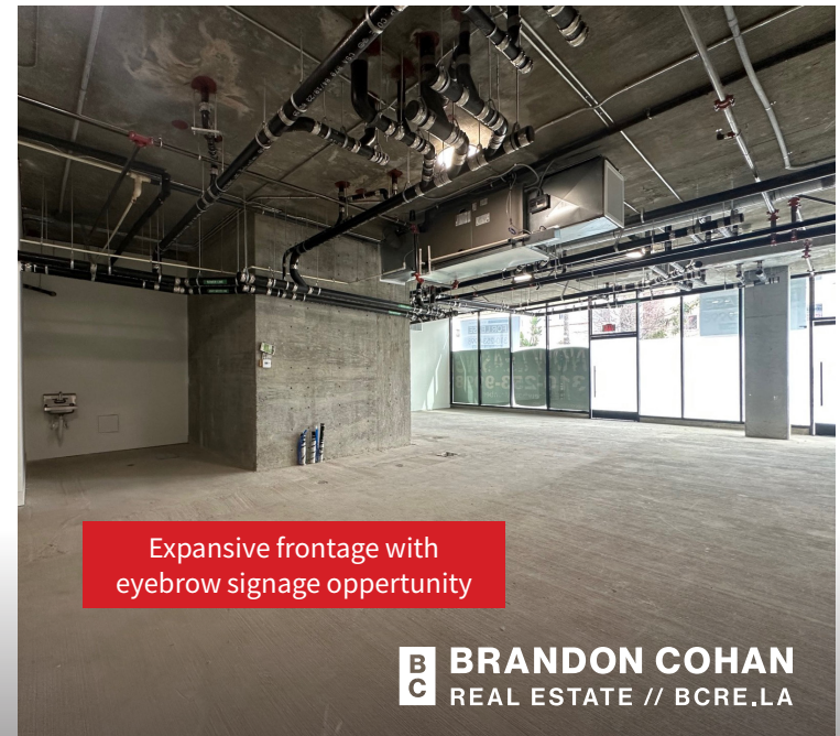
Expansive frontage with eyebrow signage opportunity

Brandon Cohan | brandon@bcre.la | 310 654 0200 Brandon Zarrabi | zarrabi@bcre.la | 310 492 3597