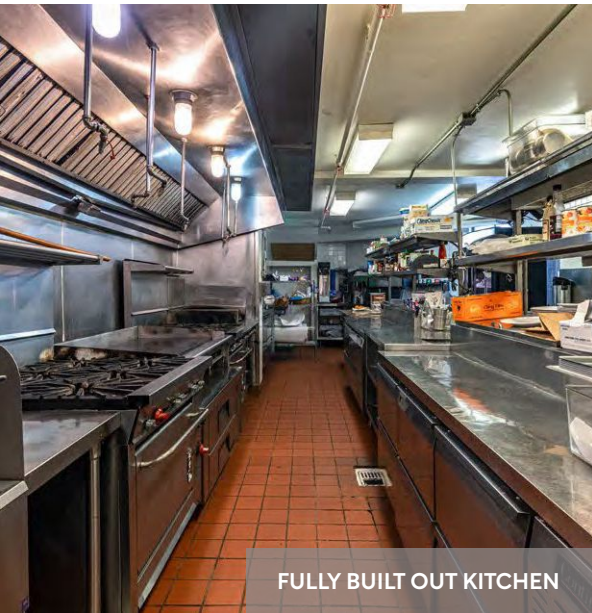
FULLY BUILT OUT KITCHEN