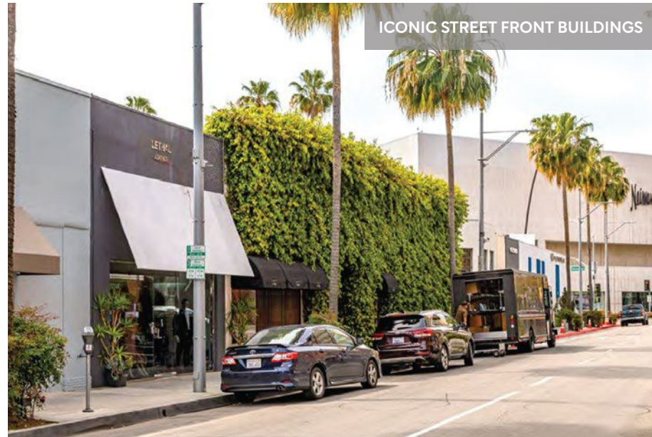
ICONIC STREET FRONT BUILDINGS