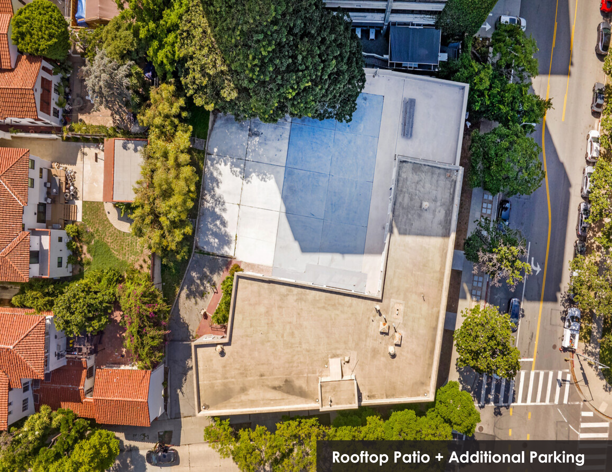
Rooftop Patio + Additional Parking