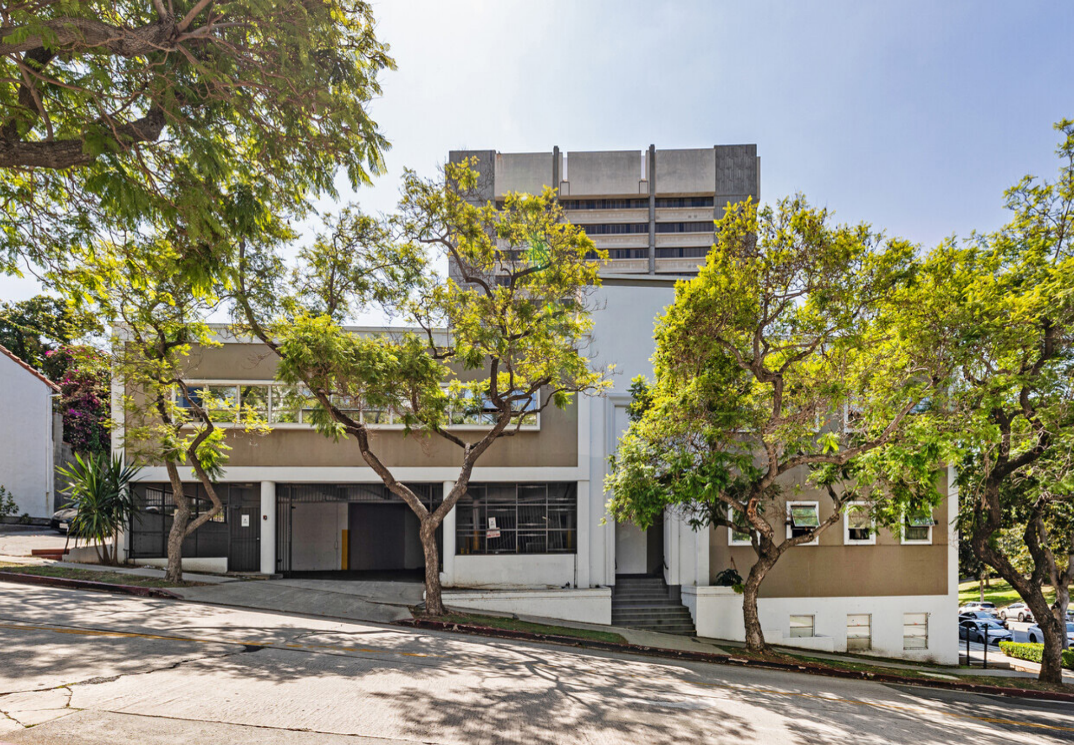
Freestanding Flagship Creative Office Building in the Heart of Westwood Village. Directly across the Street From UCLA, this is an absolute turn-key Location.